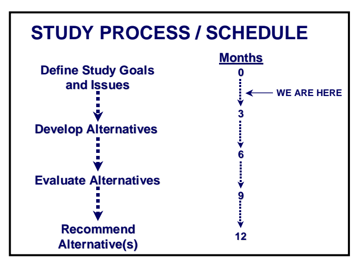
Figure 1: Study Process / Schedule

He discussed that a range of alternatives from simple spot improvements to new roads will be considered. He also presented the general evaluation process, noting that transportation, community, and environmental issues will be considered in the evaluation. The end result is a recommended project or set of projects.